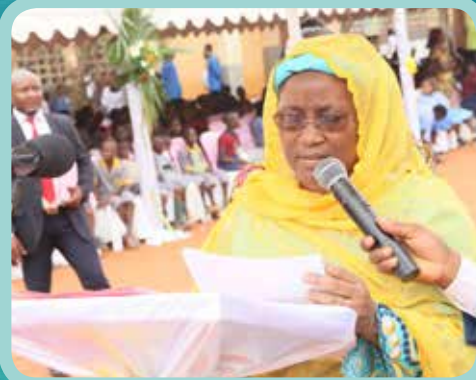
H.E Yousseuf Hadidja Alim Minister of Basic Education

President of the National Steering Committee for SCH control