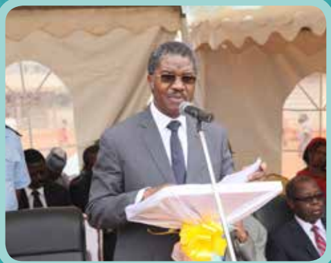
H.E André Mama Fouda Minister of Public Health

The TES Conference 2017 is under the patronage of The Minister of Public Health, H.E. André Mama Fouda , and The Minister of Basic Education, H.E. Yousseuf Hadidja Alim